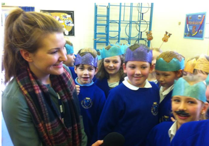
On Christmas party day BBC radio Lincolnshire came to interview children about the new kitchen.

We would particularly like to collect parents' views on the type of end of year report you would like to receive. At the moment they are fairly descriptive but there is an opportunity to have a more factual approach, which might give more clarity about attainment and progress as we move to a new assessment system.